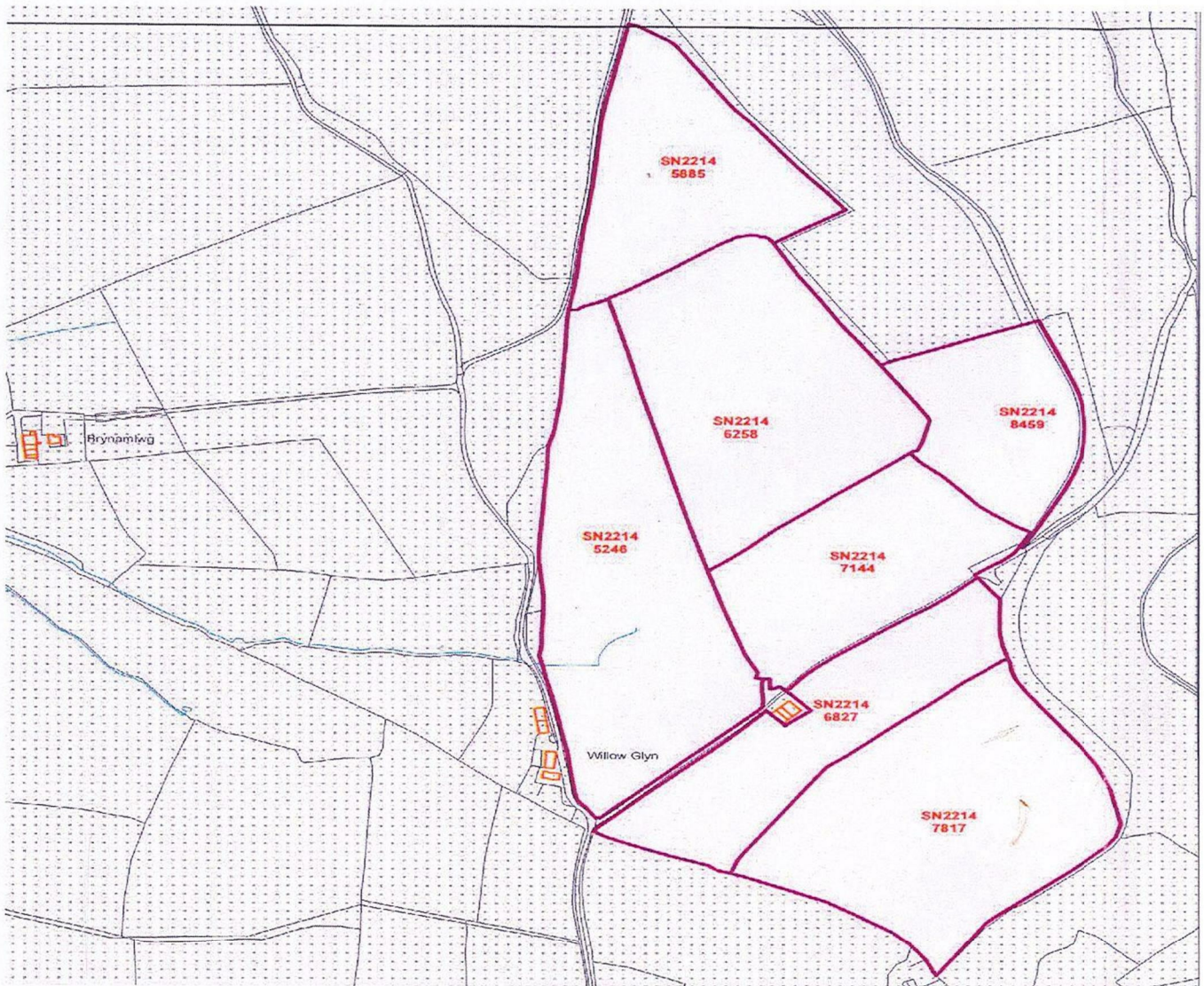
Location Plan for Identification Purposes only