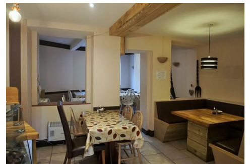
Corner Cafe, Market Square, Fishguard, Pembrokeshire, SA65 9HA