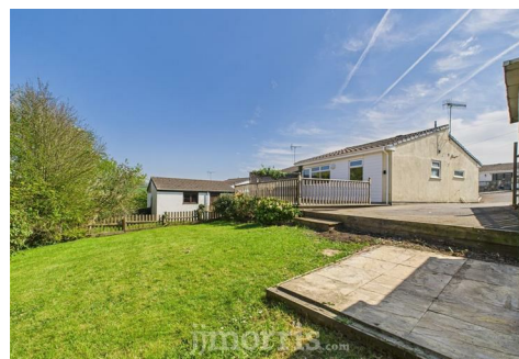
18 The Moorings, St. Dogmaels, SA43 3LJ