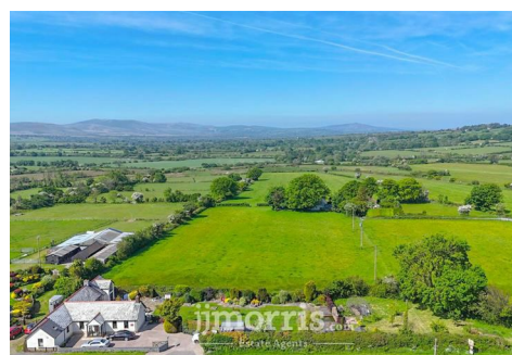
Tan Ffynnon Blaenffos, Boncath, SA37 0HT