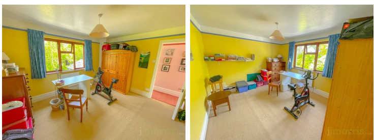
Double glazed window tot he rear, radiator.