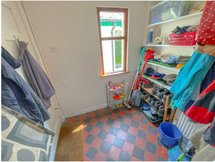
Double glazed window to the side, tiled floor, door to the rear, radiator.