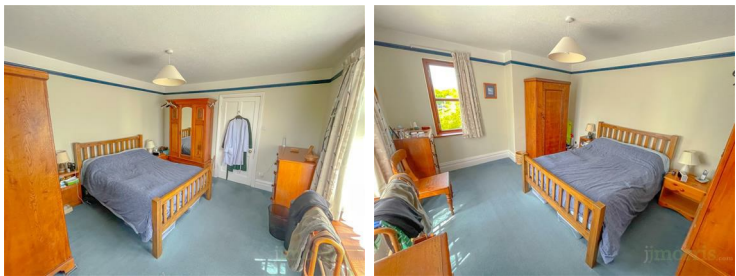
Dual aspect double glazed window, radiator.