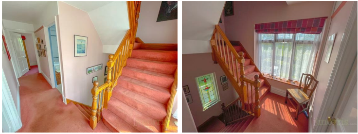
Double glazed window to the side, stairs to second floor, doors to:-