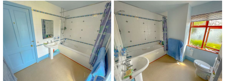
Panel bath with shower and screen over, low flush WC, pedestal hand wash basin, towel warmer, radiator, double glazed window.