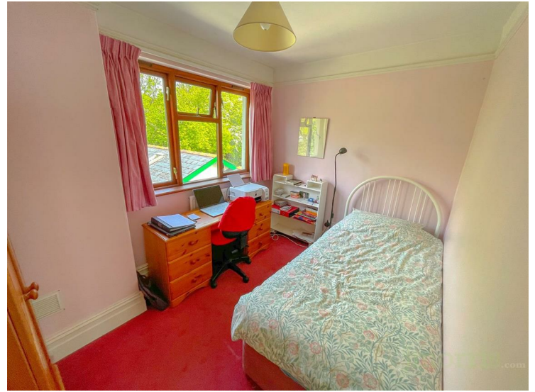
Double glazed window to the rear, radiator.