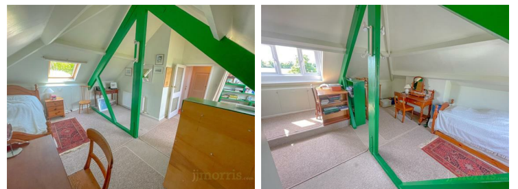
Vaulted ceiling, exposed "A" frame, Upvc double glazed window to the front, Velux roof window, eaves storage, radiator.