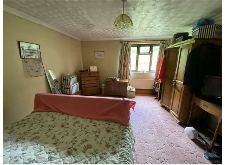
Double room, overlooking the rear with radiator.