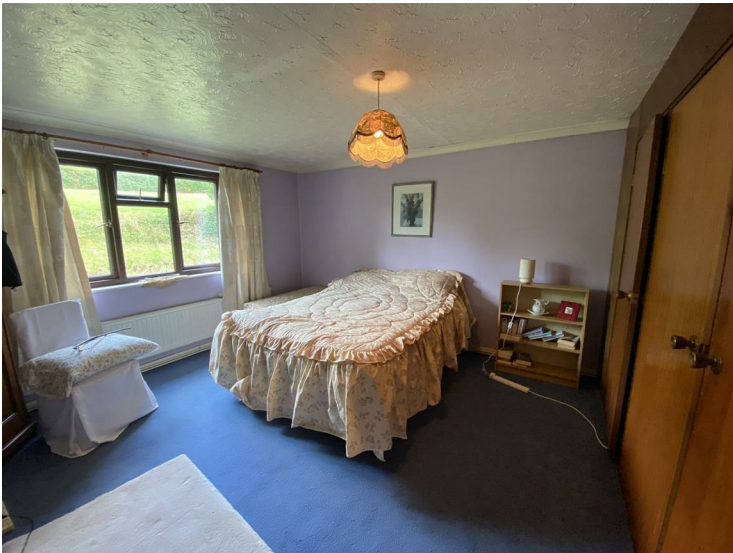
Overlooking the rear with built in wardrobes.