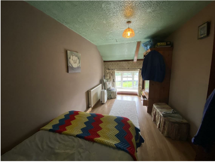
Overlooking the fore with radiator.