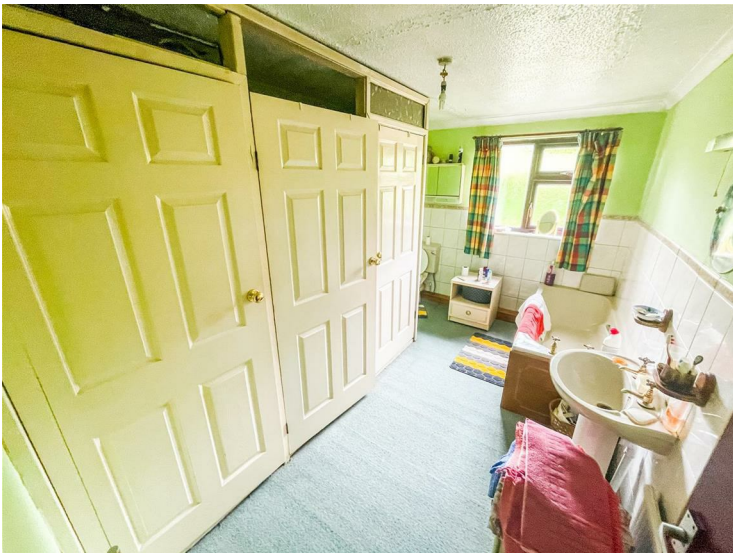
Comprising a bath, W.C., wash hand basin, radiator, partly

tilled walls, window to the rear and also housing a shelved airing cupboard with additional built in hanging cupboards.