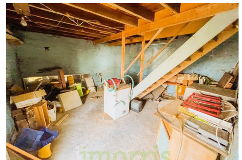
The Barn , Llanllwni, SA39 9DY