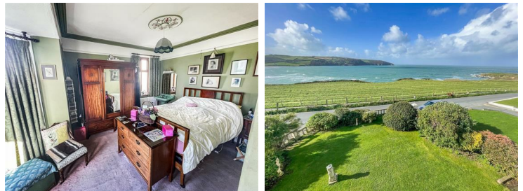
Master Bedroom 15'4" x 13'7" (4.67m x 4.14m)

Upvc double glazed bay window, window to the side, hand basin, radiator.