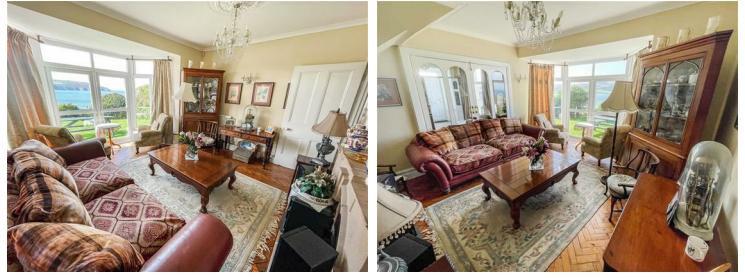
Living Room 15'3" x 13'8" (4.65m x 4.17m)

Large windows immediately draw your attention to the superb views, far reaching down the bay towards Cardigan and Cardigan Island and out to sea and inward with views of Poppit beach and countryside. French doors, woodblock flooring, fire place.