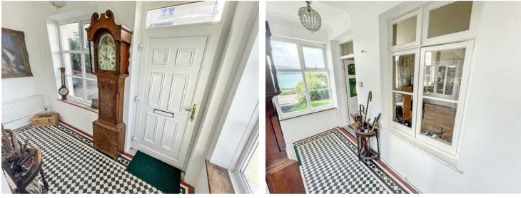
Vestibule 12'9" x 4'5" (3.89m x 1.35m)

Upvc double glazed door and dual aspect window, radiator, tiled floor.