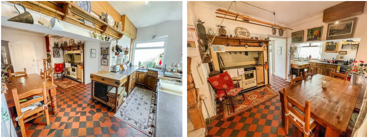
Kitchen/Diner 21'3" x 10'1" to 18'3" max (6.48m x 3.07m to 5.56m max)

Range of base units, Belfast sink, dishwasher, fridge and freezer, tiled floor, Velux windows, electric range oven.