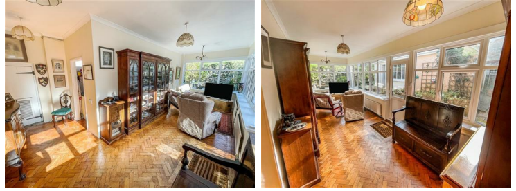
Sun Lounge 26'3" x 8'11" (8.00m x 2.72m)

Upvc double glazed window, 2 radiators, woodblock flooring, Upvc double glazed window to the side.