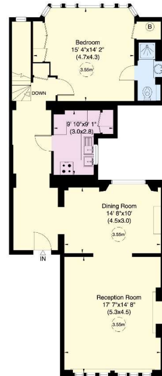
Upper Ground Floor

For guidance only and must not be relied upon as a statement of fact. All measurements and areas are approximate only (and have been prepared in accordance with the current edition of the RICS Code of Measuring Practice).