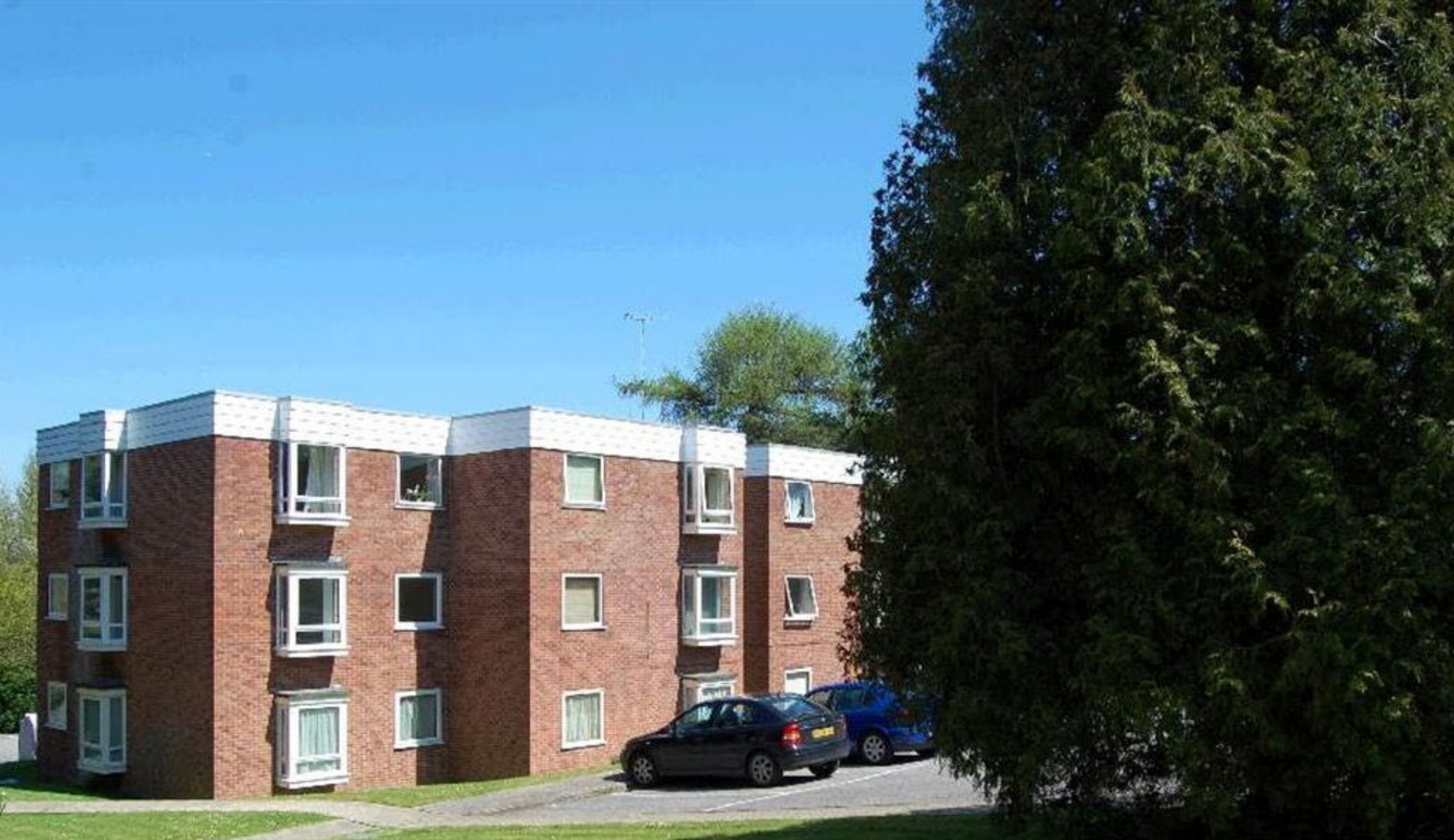
13 Firgrove Court, Hungerford, Berkshire, RG17 0DD