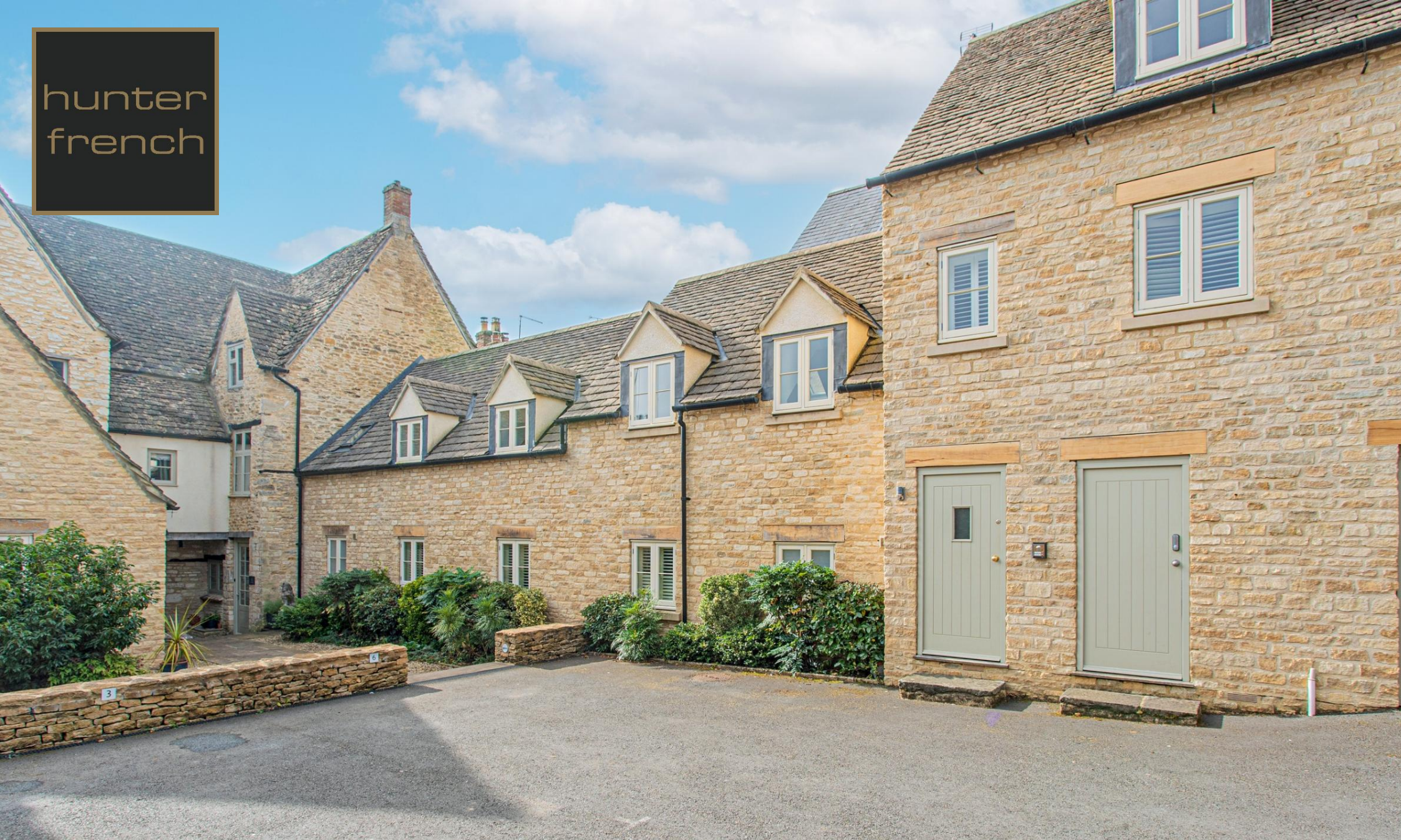
Flat 4, The Crown, The Chipping, Tetbury, GL8 8EU