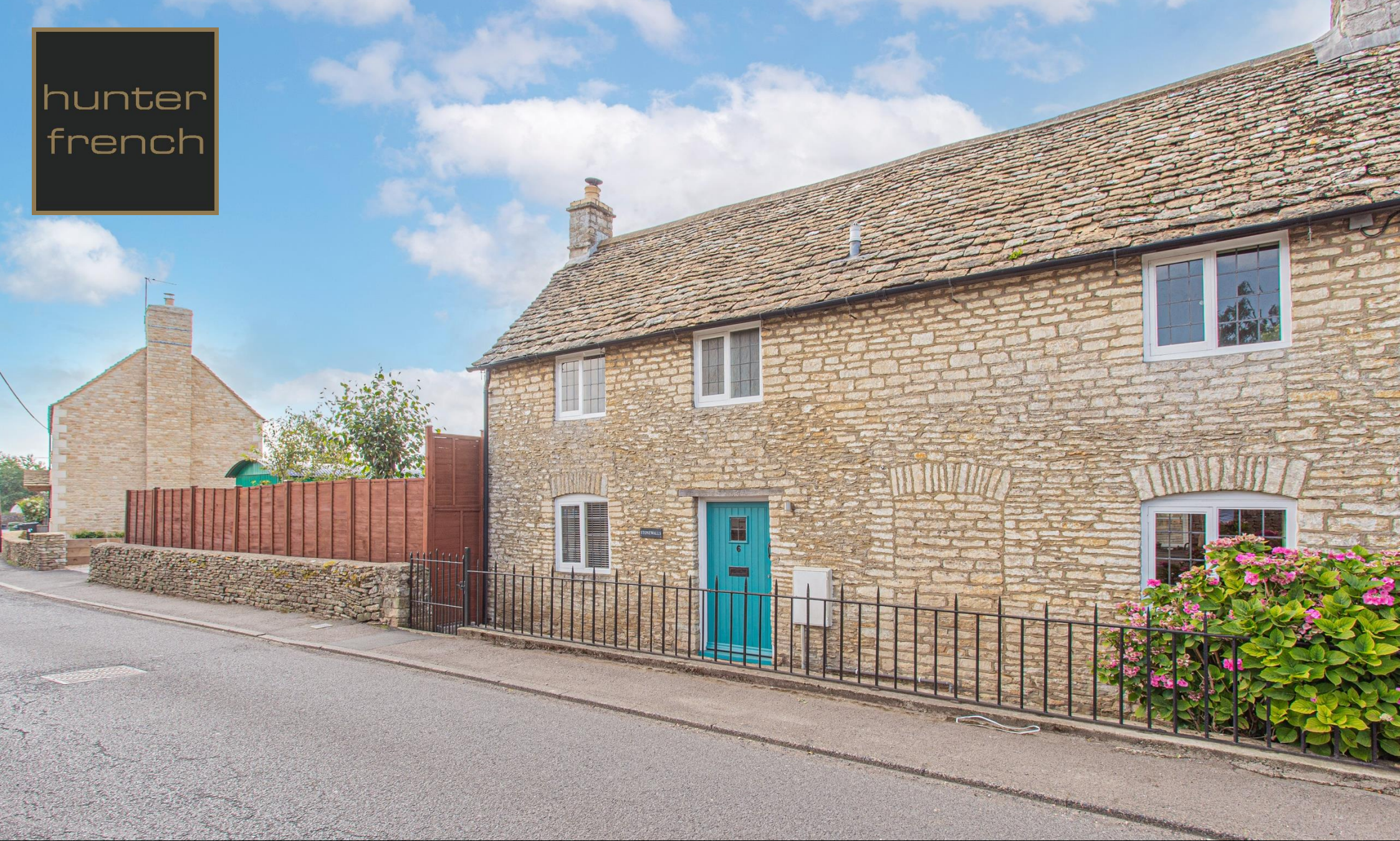
Stonewalls, 6 Chavenage Lane, Tetbury, Gloucestershire, GL8 8JW