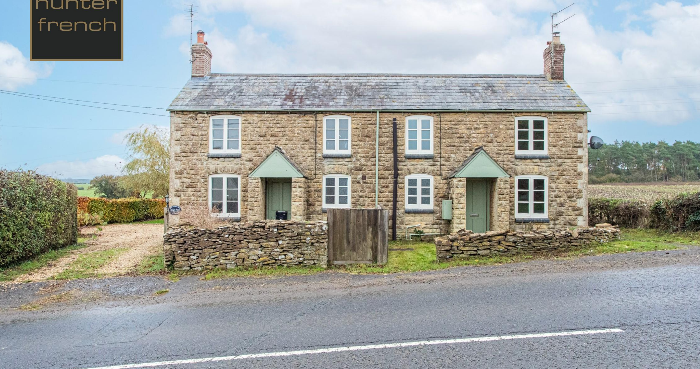
1 & 2 Sunset Hill Cottages, Brokenborough, Malmesbury, Wiltshire, SN16 0HU