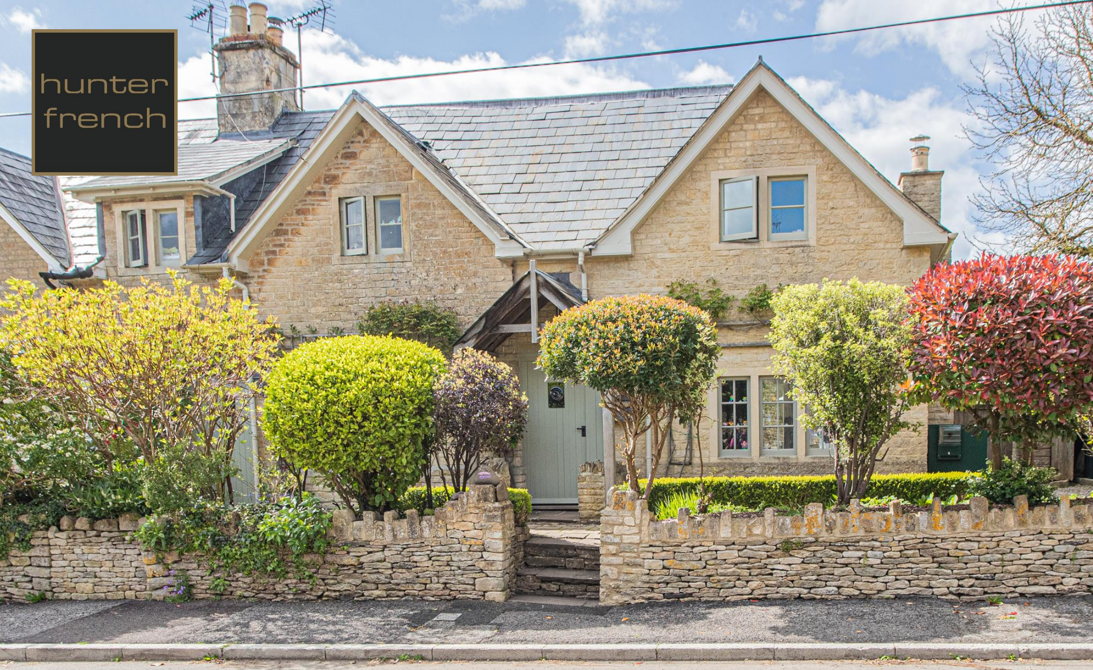
Mistletoe Cottage, The Street, Alderton, Wiltshire, SN14 6NL