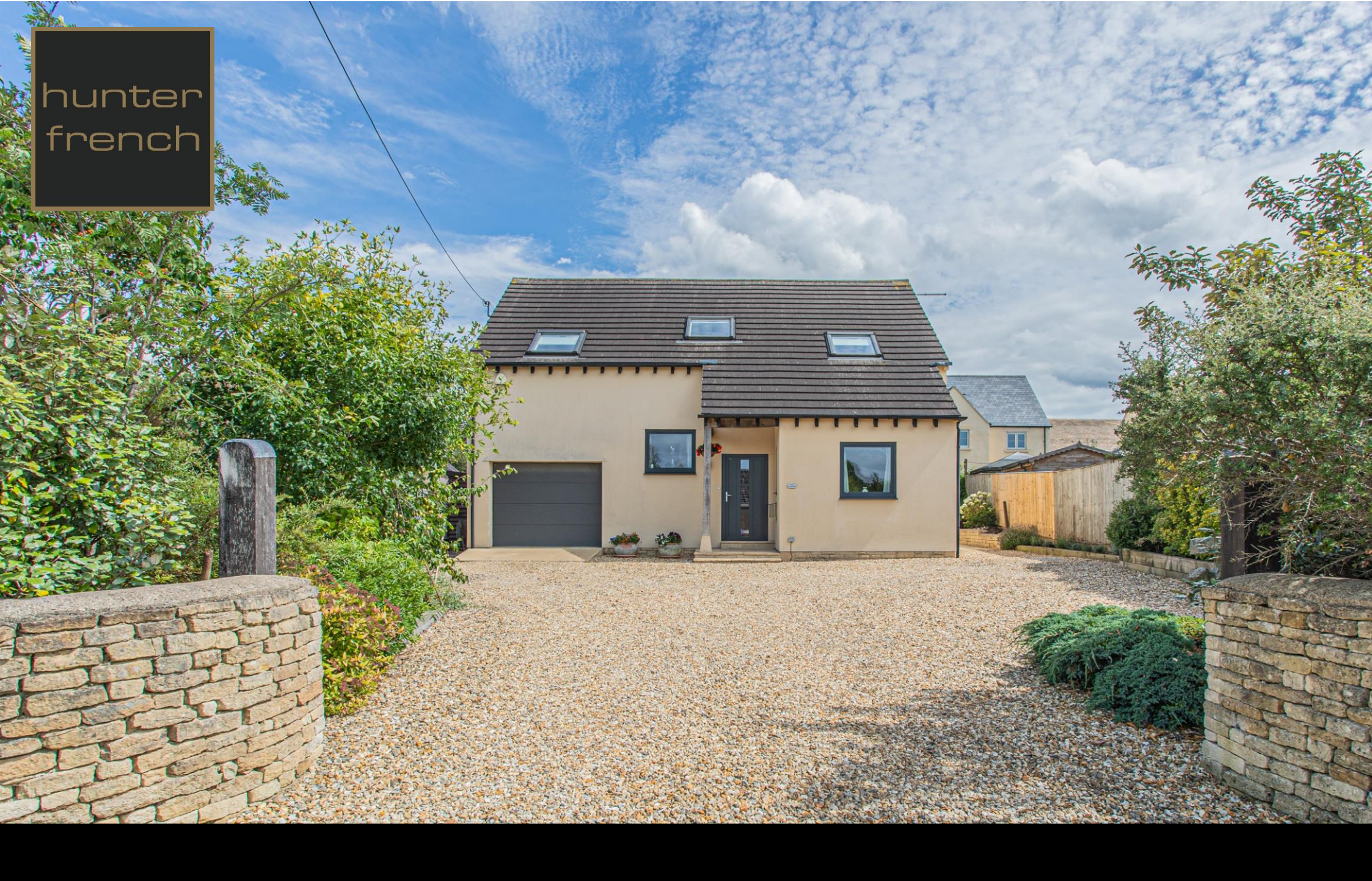
The Willows, Longfurlong Lane, Tetbury, Gloucestershire, GL8 8TJ