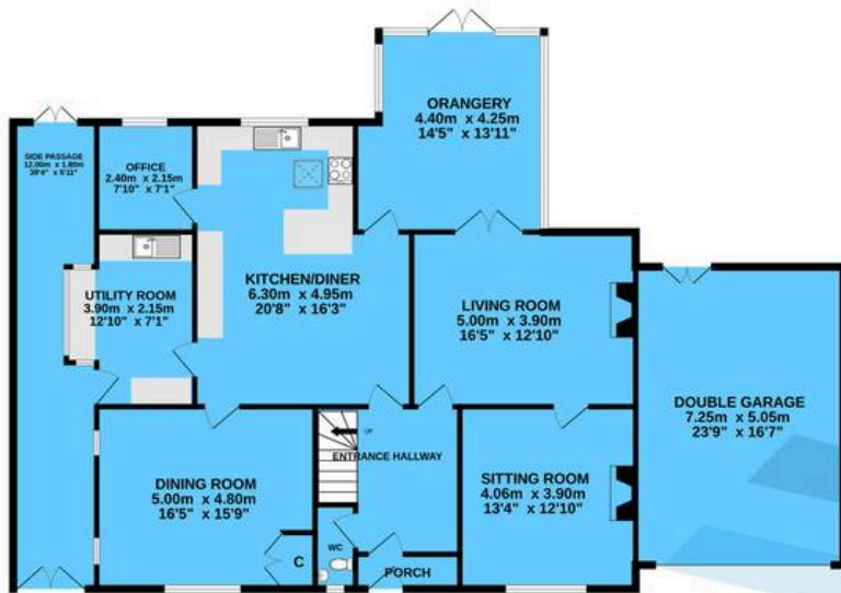
GROUND FLOOR 175.9 sq.m. (1893 sq.ft.) approx.