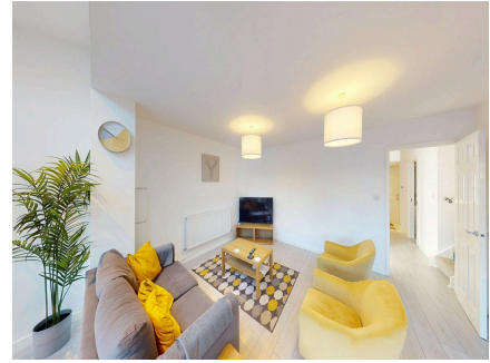
5th bedroom/ TV room