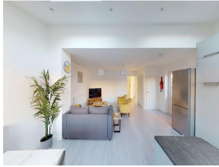
Lounge open plan to kitchen