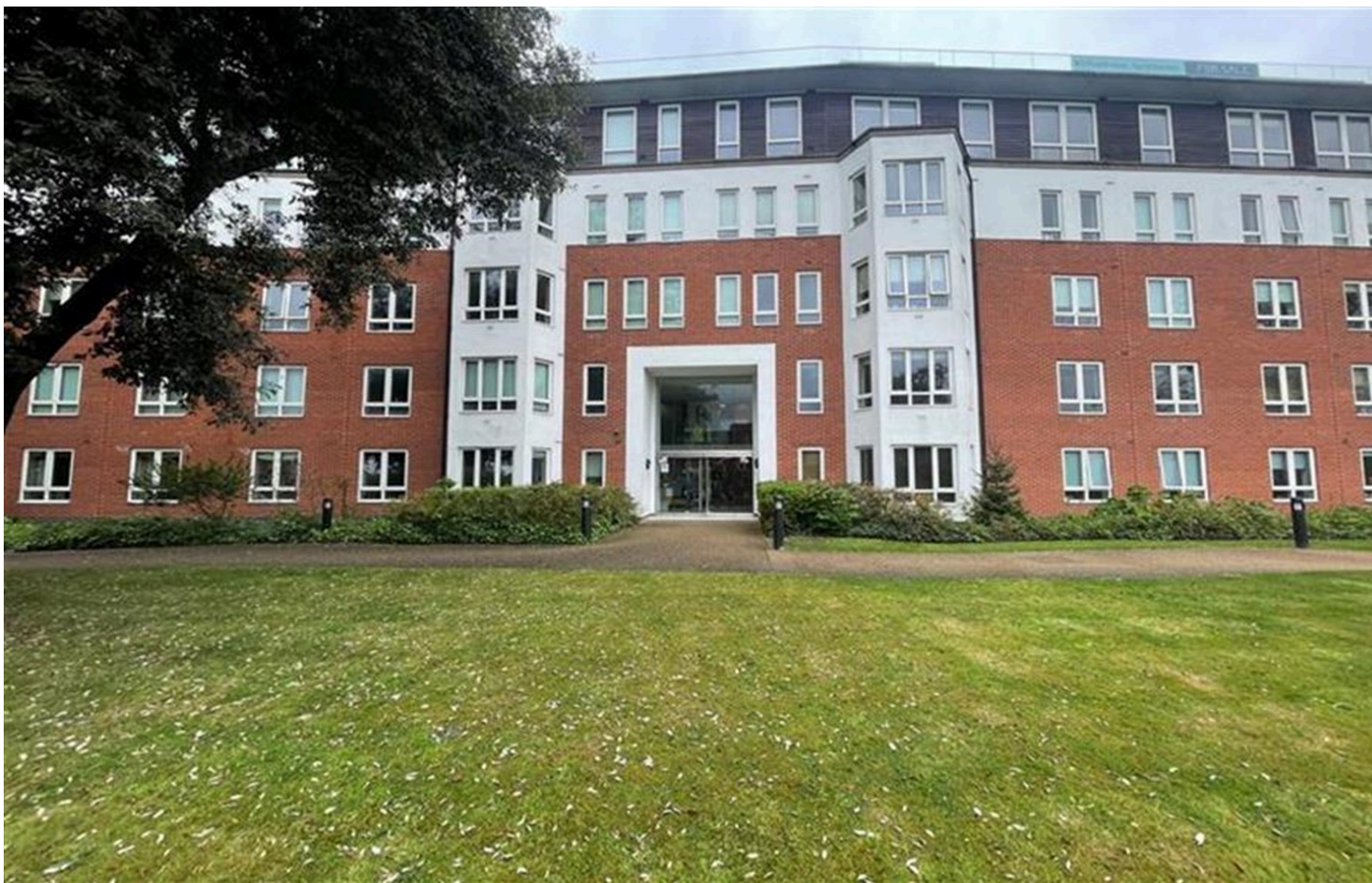
Regency Court, 8-111 High Road, South Woodford, E18