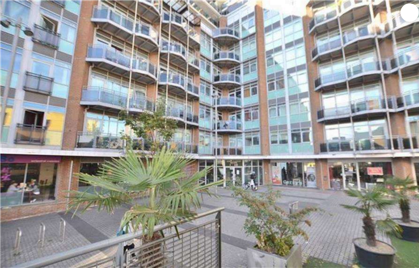
Gerry Raffles Square, Stratford, E15