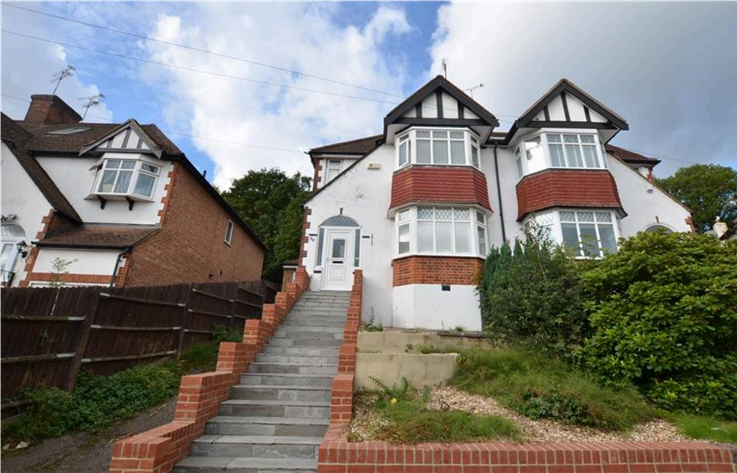
Sedley Rise, Loughton, IG10