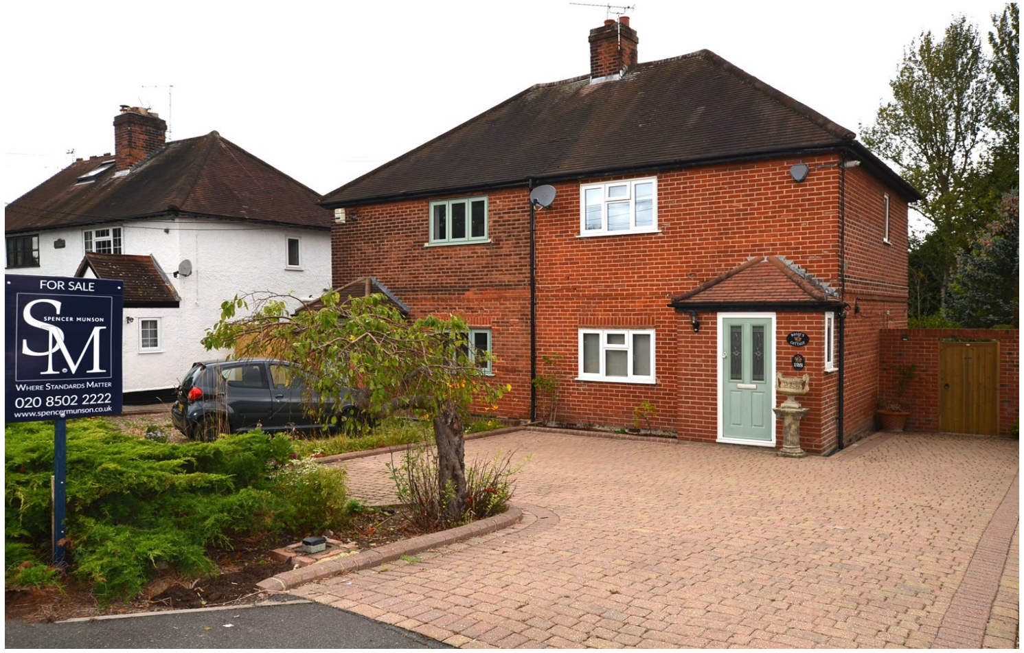
London Road, Abridge, RM4

swoodford@spencermunson.co.uk Website: spencermunson.co.uk