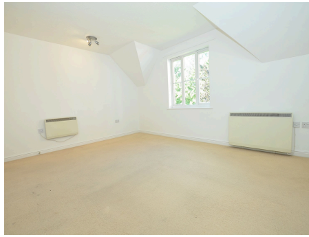
3.71m (12'2) x 4.65m (15'3) Lounge