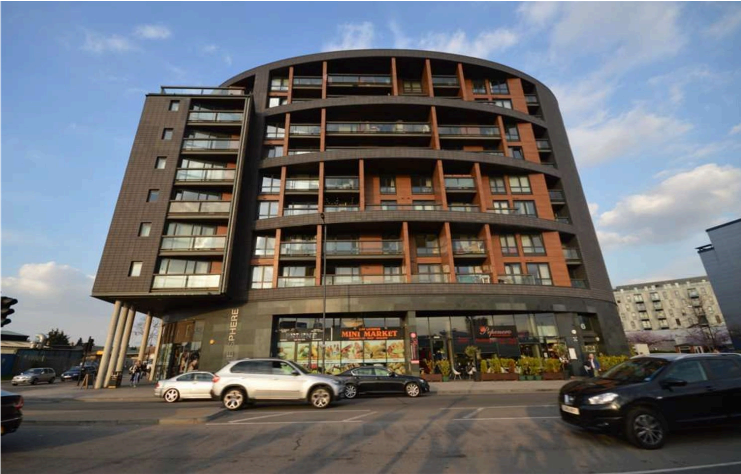
The Sphere, Hallsville Road, E16