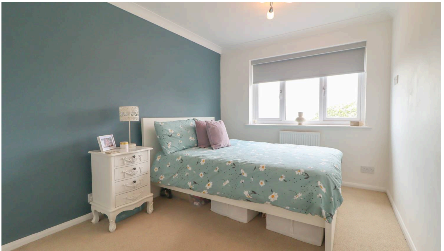
Bedroom Two 12' 7" x 8' 6" (3.84m x 2.58m)