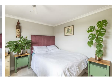
Bedroom 2 12'5" x 10'9" (3.8 x 3.29)