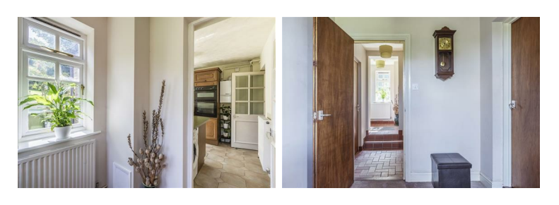
Living Rooms 6'9" x 12'11" + 11'6" x 11'3" (2.07 x 3.95 + 3.53 x 3.45)