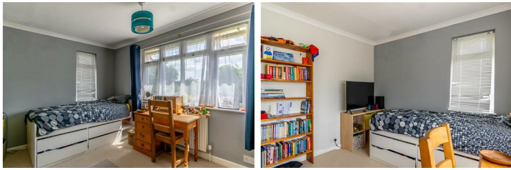
Bedroom Four 9'3" x 5'2" (2.84 x 1.60)