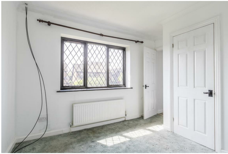
Bedroom 3 11'3 x 6'10 (3.43m x 2.08m)