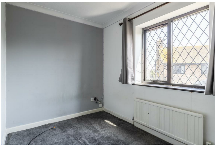
Bedroom 4 10 x 9 (3.05m x 2.74m)