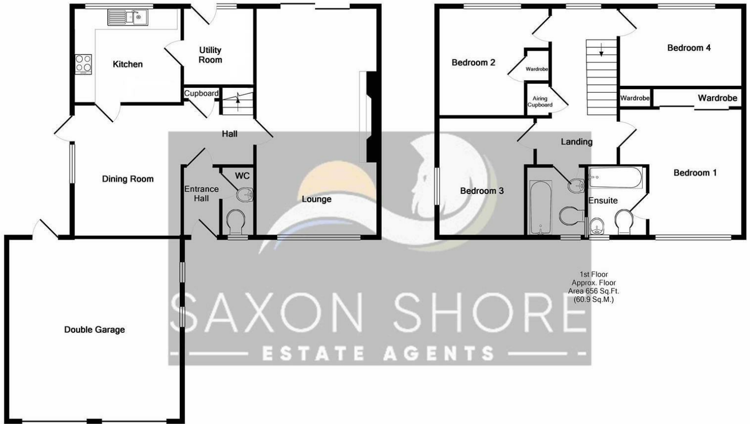
Ground Floor Approx. Floor Area 955 Sq.Ft. (88.7 Sq.M.)