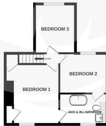
1ST FLOOR 38.1 sq.m. (410 sq.ft.) approx.