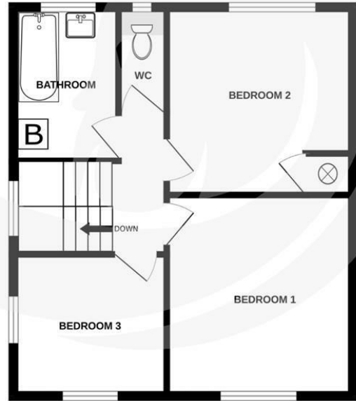
1ST FLOOR 44.0 sq.m. (473 sq.ft.) approx.