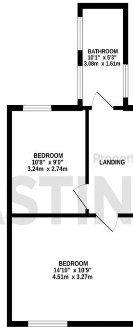
1ST FLOOR 370 sq.ft. (34.3 sq.m.) approx.