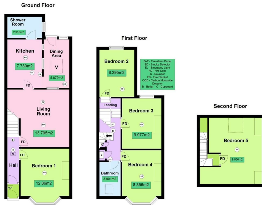
5 Thornbank Place, Bath