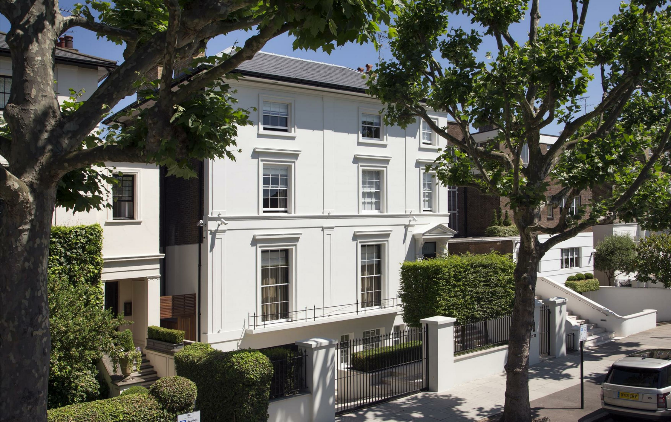
60 Hamilton Terrace, St John's Wood London NW8 9UJ Price on application Freehold