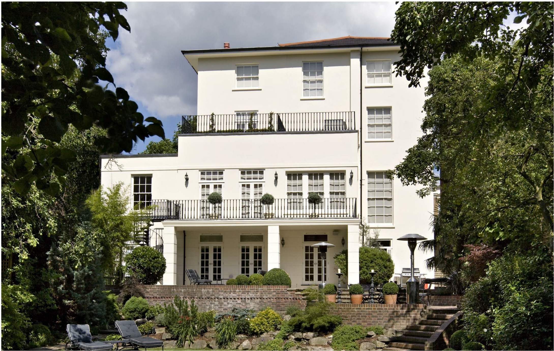
Hamilton Terrace, London NW8 9RG Asking price £1 1,950,000 Freehold