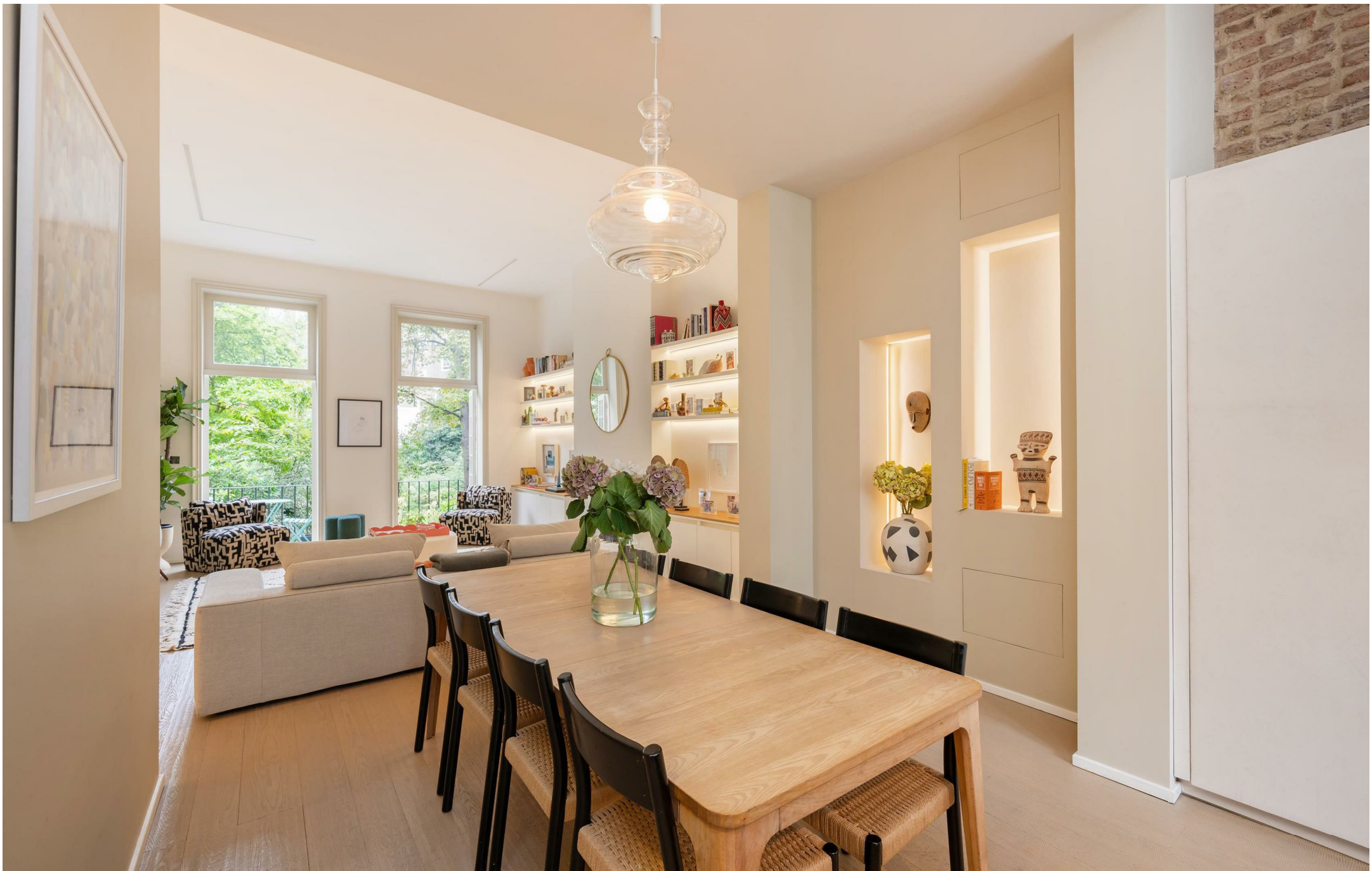
12 Randolph Crescent, London W9 1DR Asking price £5,250,000 Leasehold - Share of Freehold