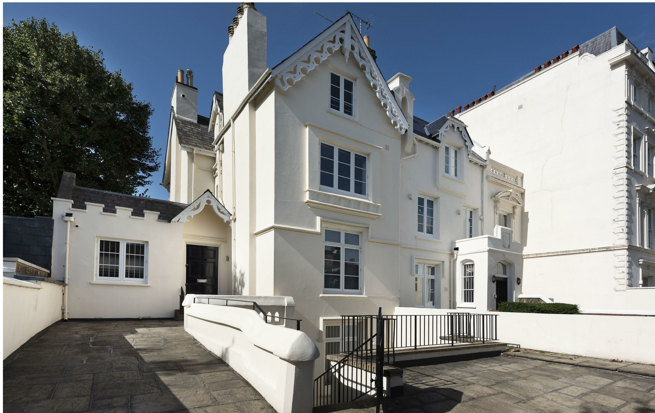
1 Randolph Avenue, Little Venice London W9 1BH Asking price £7,000,000 Freehold