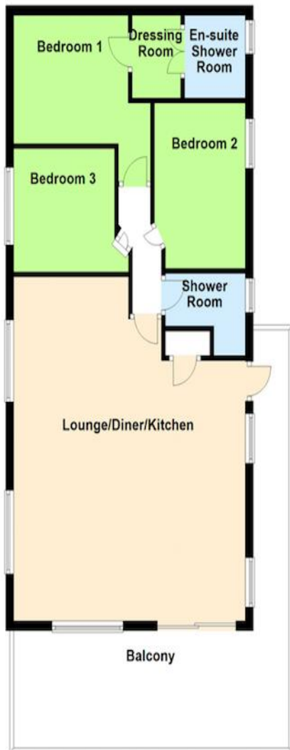
Ground Floor Approx. 72.1 sq. metres (776.5 sq. feet)

Total area: approx. 72.1 sq. metres (776.5 sq. feet)