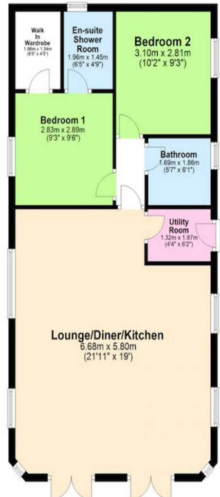
Ground Floor Approx. 67.5 sq. metres (726.7 sq. feet)

Total area: approx. 72.1 sq. metres (776.5 sq. feet)