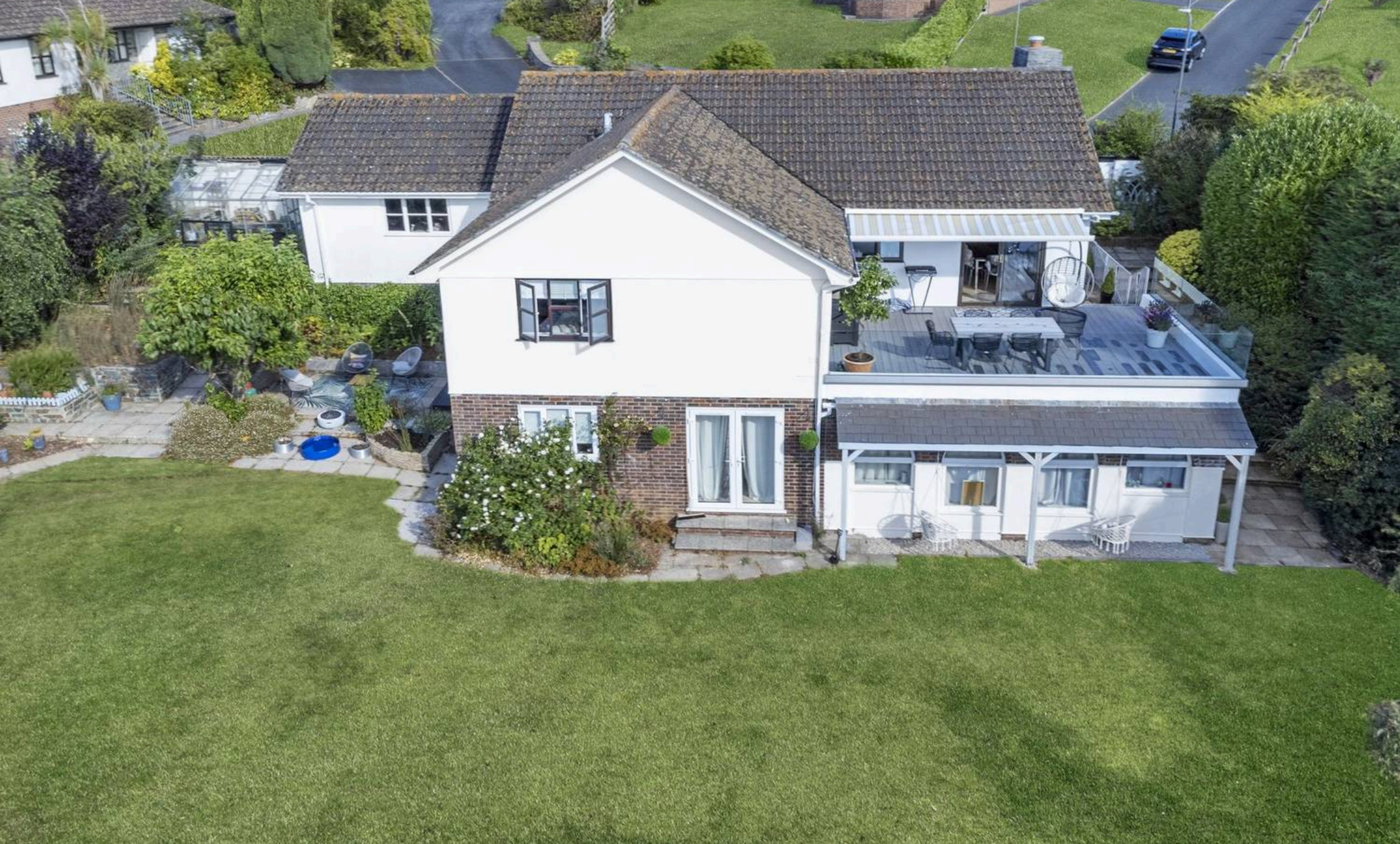
8 Bala Brook Close, Brixham – TQ5 0RQ £645,000