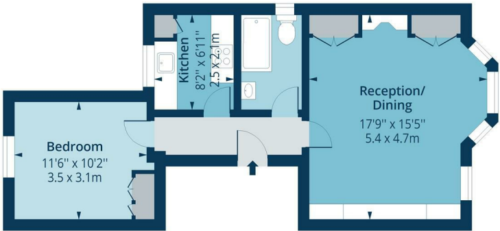
First Floor Floor Area 534 Sq Ft - 49.61 Sq M