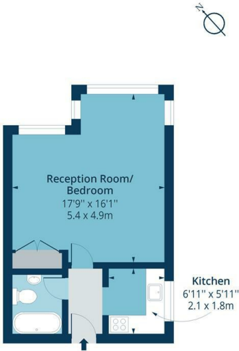
Second Floor Floor Area 375 Sq Ft - 34.84 Sq M

Deanswood, N11 Approx. Gross Internal Area 375 Sq Ft - 34.84 Sq M