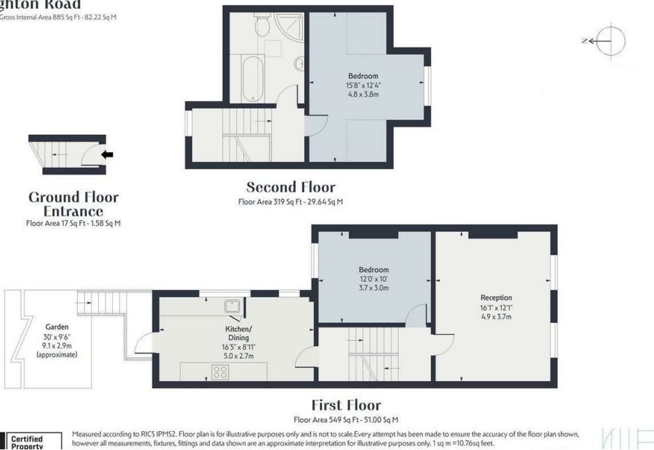
Brighton Road Approx. Gross Internal Area 885 Sq Ft - 82.22 Sq M