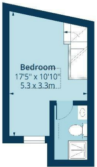
First Floor Floor Area 191 Sq Ft - 17.74 Sq M