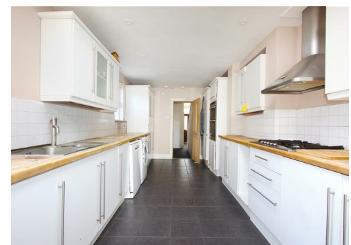
Fairfax Road, N8 £2,450 FOR SALE