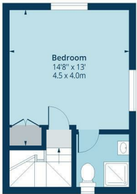
Second Floor Floor Area 250 Sq Ft - 23.22 Sq M

For Illustrational Purposes Only - Not To Scale lpaplus.com