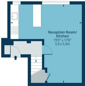
First Floor Floor Area 304 Sq Ft - 28.24 Sq M