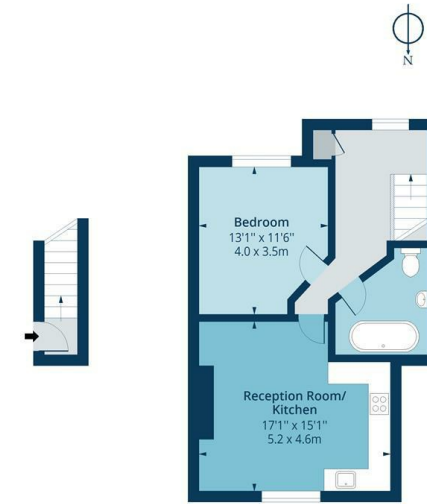
First Floor Floor Area 33 Sq Ft - 3.07 Sq M