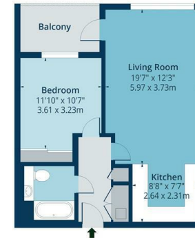
Floor Area 562 Sq Ft - 52.21 Sq M

For Illustrational Purposes Only - Not To Scale lpaplus.com