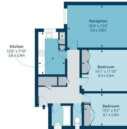
Second Floor Floor Area 879 Sq Ft - 81.66 Sq M