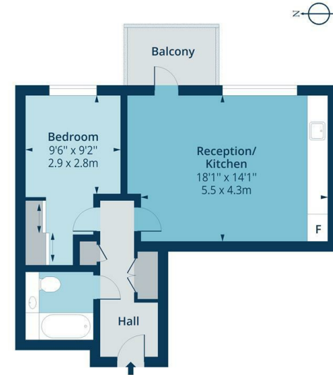
Fifth Floor Floor Area 543 Sq Ft - 50.44 Sq M