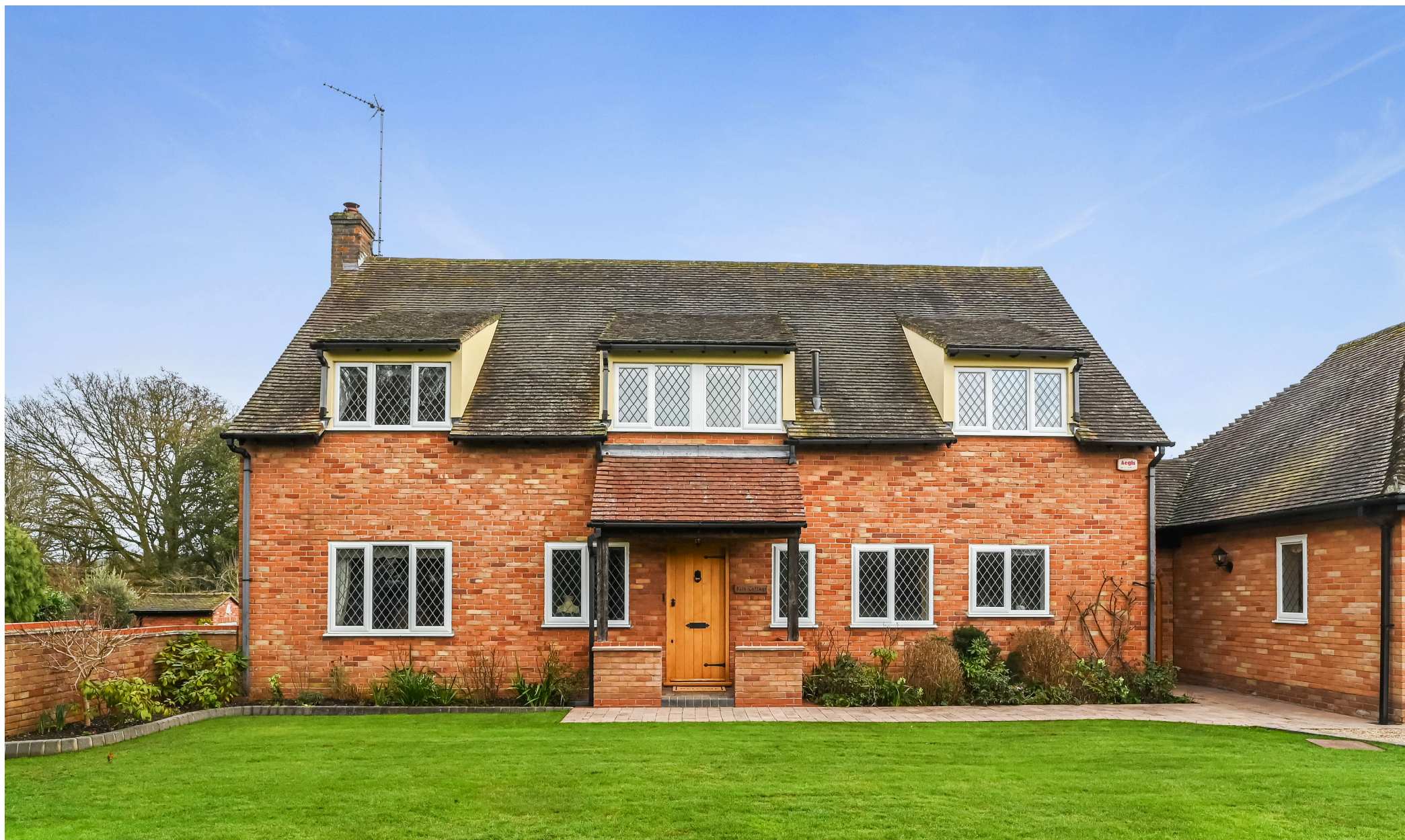
The Folley | Layer-de-la-haye | CO2 0HZ