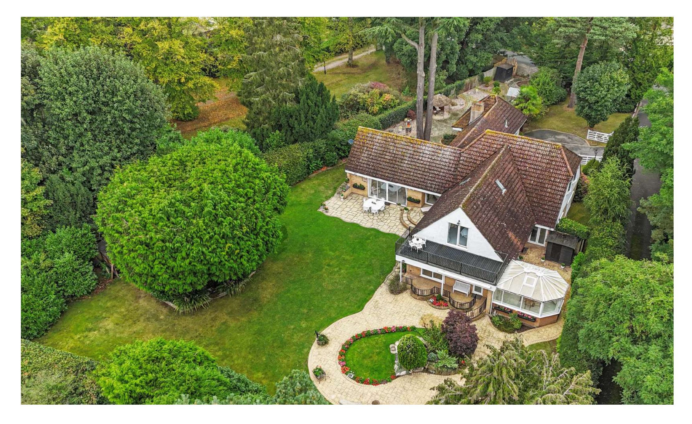
Beacon Hill | Wickham Bishops | CM8 3EA